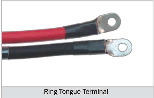
Ring Tongue Terminal