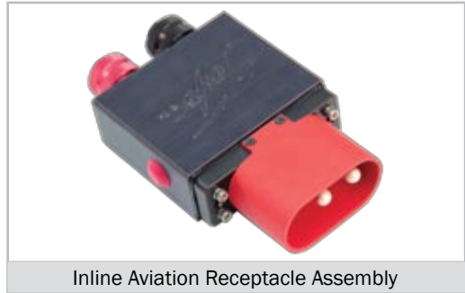
Inline Aviation Receptacle Assembly